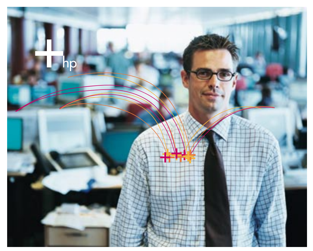
HP Color Laserlet Promotion

$250 Cashback when you purchase BOTH an HP Color LaserJet 3500 printer AND an HP Compaq business Desktop or Notebook PC