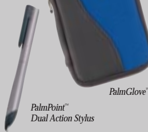
PalmPoint™ Dual Action Stylus