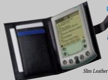
Slim Leather Case