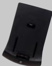
Palm V™ Modem

Folded, it measures just 9 cm x 12.8 cm x 2.9 cm and weighs 225g.